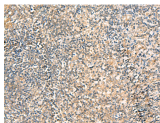
Immunohistochemistry of paraffin-embedded Human tonsil tissue using TXNDC12 Polyclonal Antibody at dilution of 1:50(×200)