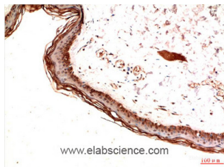
Immunohistochemistry of paraffin-embedded Human skin tissue using PDGFRA Monoclonal Antibody at dilution of 1:200.