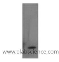
Western Blot analysis of Recombinant Human TNF alpha Protein using TNF alpha Monoclonal Antibody at dilution of 1:2000. Observed Mw:17,25kDa